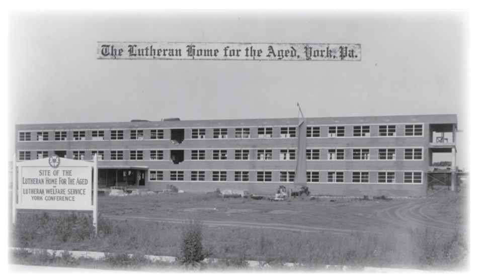
Construction of York Lutheran Home for the Aged nears completion.

Touch-a-Life – Services for those of any agewithspecificshort-term needforsupport–including companionship,errandsand transportation.