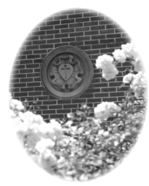
Roses bloom at The Village at Kelly Drive.