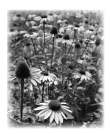
Perennialgardenpleases the senses.

In 1994, the year after the skilled care center at The Village at Sprenkle Drive in York opened, renovations were made to The Village at Kelly Drive. The former infirmary was replaced with apartmentsandroomsforpersonal care/assisted living. Renovations were made again in 1995 and 1998. The Phase II renovations were dedicated June 23, 1998.