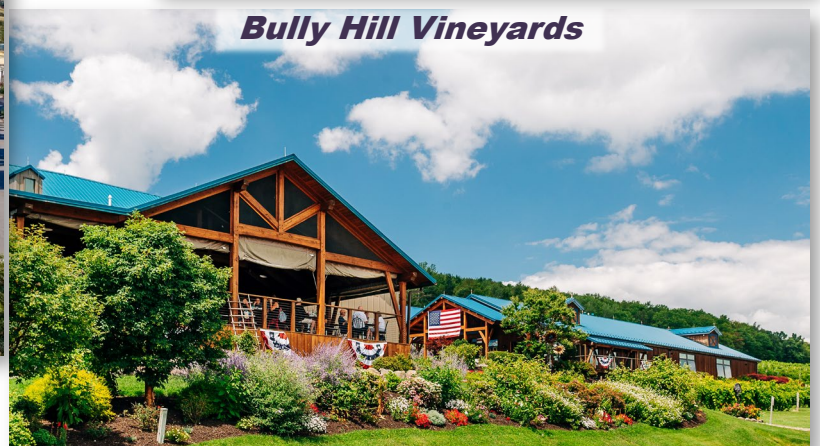
Bully Hill Vineyards

Prices are subject to change due to other vendor charges. Itinerary is subject to change.