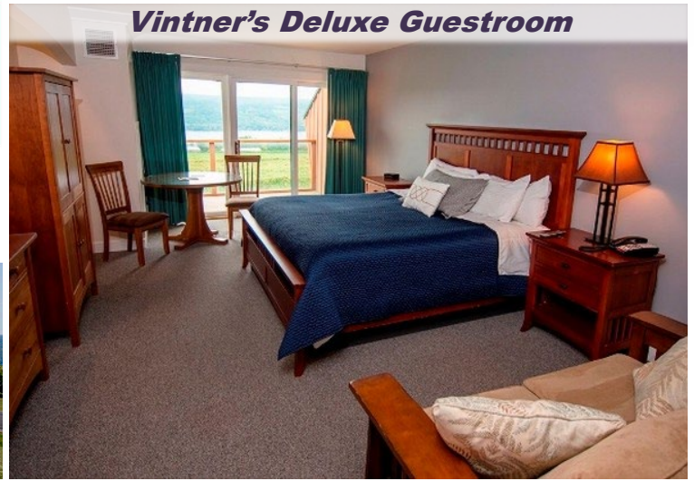
Vintner's Deluxe Guestroom

Setting the Standard of Excellence Since 1977