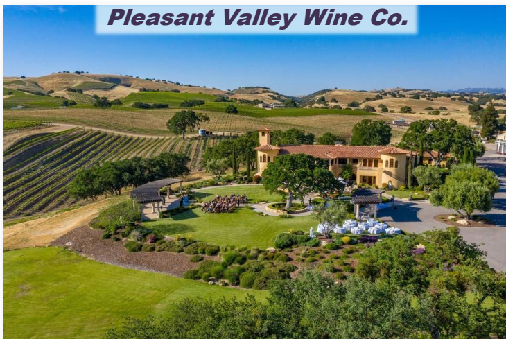
Pleasant Valley Wine Co.